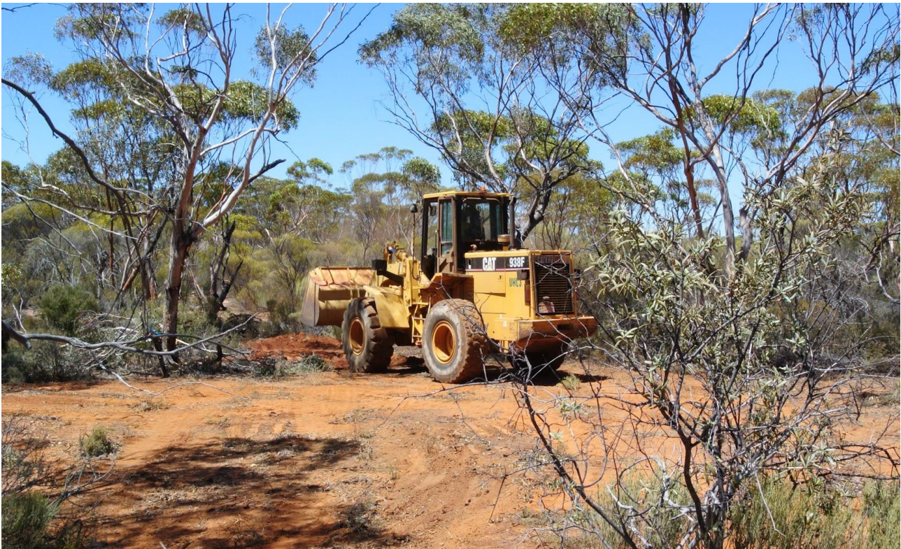
Figure 1: Commencement of site preparation over Lepidolite Hill Project

Site preparation works have commenced to ensure drilling to be conducted in the first half of February.