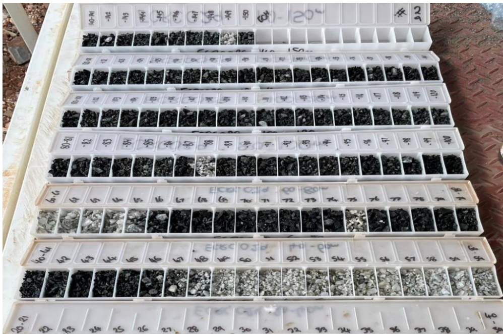
Figure 2 - Drill chips of the drill hole ECRC029