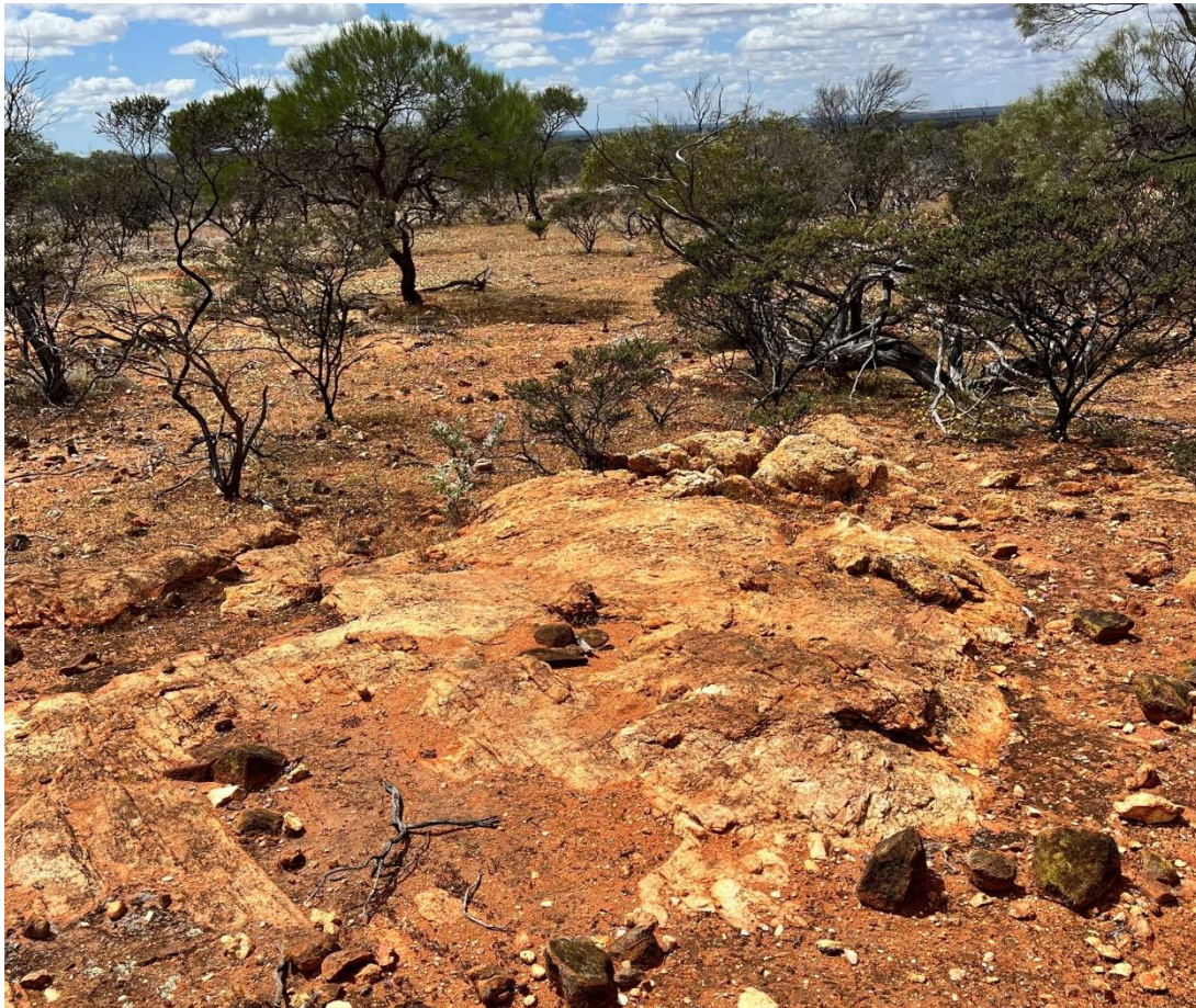
Figure 2: Pegmatite outcrops identified at Yalgoo West Project

Field mapping and surface geochemistry is planned to assess the Tenements for pegmatite-hosted Lithium-Caesium-Tantalum (LCT) mineralization.