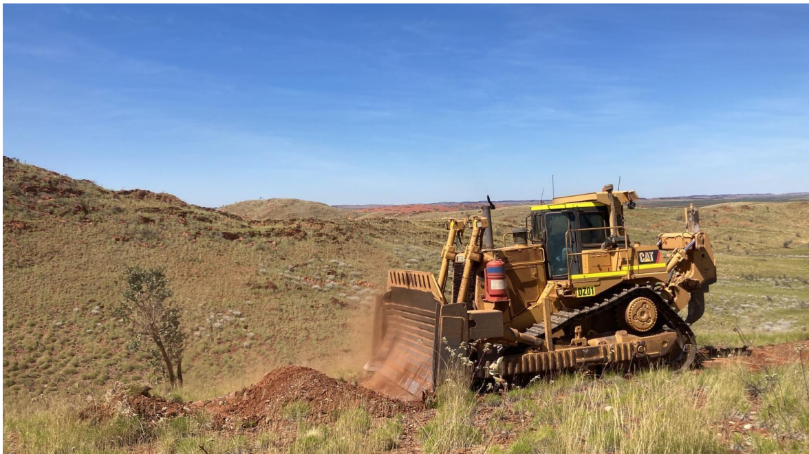
Figure 1: Commencement of drill pads preparation over Trigg Hill Project

Mapping and rock chip sampling will continue in areas previously not covered.