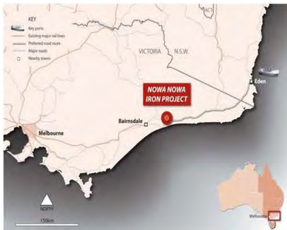
Figure 1 - Location of the Project

The Project is located in East Gippsland, Victoria and is proximal to the Princess Highway which provides access to several nearby towns and the existing export port facility at Eden in southern NSW.