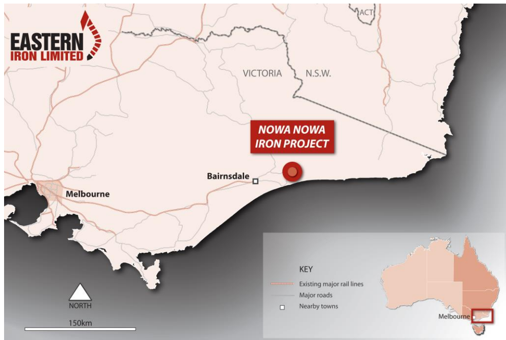
Figure 1 - Nowa Nowa Locality Plan

The Nowa Nowa Iron Project is located some 250 kilometres east of Melbourne close to the Princes Highway, which provides ready access to several nearby towns and possible export sites (Figure 1).